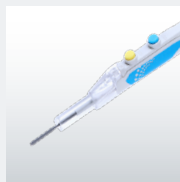
GOLDVAC ® SLIM PENCILS